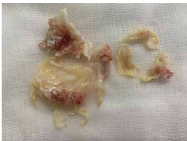
Fig. 3. The cusps of the aortic and mitral valves affected by vegetation and infection.

Objective. To determine the pathogenetic relationship of two coexisting anatomically different urological and cardiac pathologies in a specific clinical case.