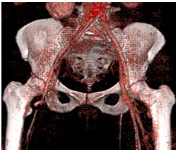
Fig. 1. CT-angio, false aneurysm of right distal anastomosis – yellow arrow.

Because of suspicion at infection we resected the false aneurysm in the right groin and revascularized right lower extremity by in-situ saphenous graft. Despite of massive antibiotic treatment on the tenth postoperative day massive bleeding occurred in the right inguinal area. We operated the patient immediately and we found massive infection in the right groin. We decided for excision of infected graft and we restored blood supply to right lower extrem-