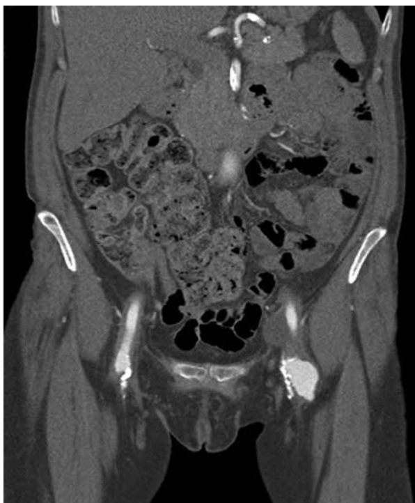
Fig. 6. Perigraft fluid – yellow arrow, false aneurysm – blue arrow.

we decided for in situ reconstruction. Aorta and both common iliac arteries were desobliterated by local endarterectomy. Left external iliac artery was revascularised by Vollmar endarterectomy from left groin. It was not able to perform Vollmar endarterectomy of external iliac artery at the right side therefore we reconstructed right iliac external artery by right femoral vein. We used in situ reconstruction with only autologous material. Postoperative course was without complications. Cultures from perigraft fluid and the graft were negative. But we administered antibiotics (ciprofloxacin and clindamycin) intravenously. She was discharged at the 9 th postoperative day at per oral antibiotic treatment (ciprofloxacin). She is followed up in our out-patient ambulance. Now she is without sign of infection, wounds are healed, CRP is 15 mg/l. She walks without claudication pain; right lower extremity is without edema.