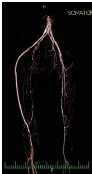
Fig. 2. CT-angio, Extra ananatomical iliaco (prosthesis) popliteal lateral bypass, anastomoses are marked by yellow arrows.

ity by extra anatomical iliaco-popliteal lateral bypass grafting. Proximal anastomosis was constructed in retroperitoneum in macroscopically infection free part of the right limb of aortobifemoral graft. The graft of extra anatomical bypass was placed on the lateral site of the thigh and approach to popliteal artery was from lateral incision. CT –angio reconstruction shows this lateral popliteal extra anatomical bypass (Fig. 2.).