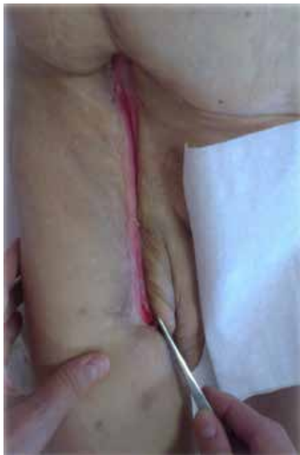
Fig. 3. Right groin: secondary healed.

from left groin to the previously constructed right iliacopopliteal lateral bypass which was without signs of infection. Then we performed re-laparotomy. We found covered perforation of duodenum (part D3) that was in direct contact with the Dacron graft. The perforation was the direct cause of the infection. We removed the infected Dacron graft and the defect in duodenum was over sewn. We added nutrition jejunostomy. There was prolonged bowel paralysis in postoperative course. The patient was fed by parenteral and enteral nutrition and parenteral for two weeks. After two weeks a peroral intake of food was able. Cultures from the graft and also surrounding tissue were negative but despite the negative cultures we administered patient antibiotics according previous cultures. We administered vankomycin, meropenem, colimycin and fluconazol intravenously.