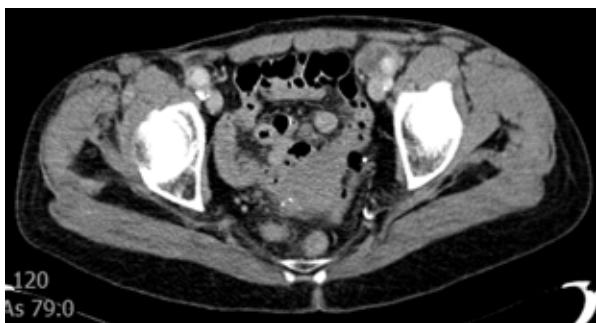
Fig. 5. CT – Perigraft fluid, yellow arrow.